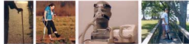
Lift Chairs / Scooters / CPAP / Walkers etc.

A new retail store focused on bringing a more independent lifestyle to those who rely on others for their healthcare.